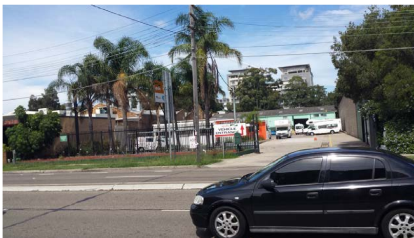
Figure 2. Subject site at No. 665-669 when viewed from Gardeners Road

Council received Development Application No. 13/135 on the 2 August 2013, which originally sought consent for a mixed use development comprising the following: